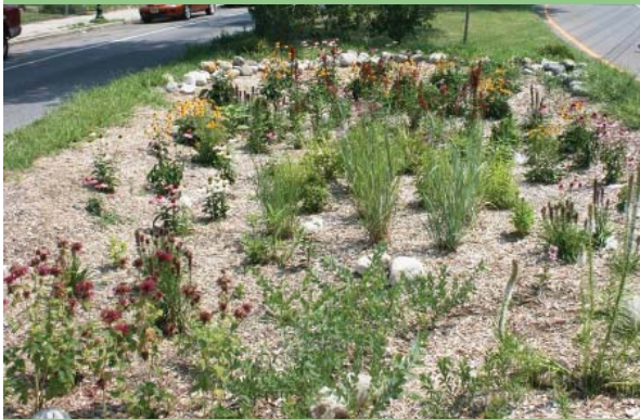
Rain garden on Park Blvd., Parkside neighborhood