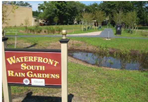
A former gas station is now home to four rain gardens at Broadway and Chelton Ave.