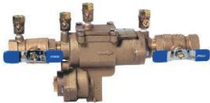
Reduced Pressure Principle Backflow Prevention Assembly (RPZ)