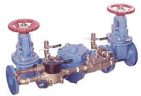
Double check detector assembly (DCDA)