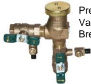
Pressure Vacuum Breaker (PVB)